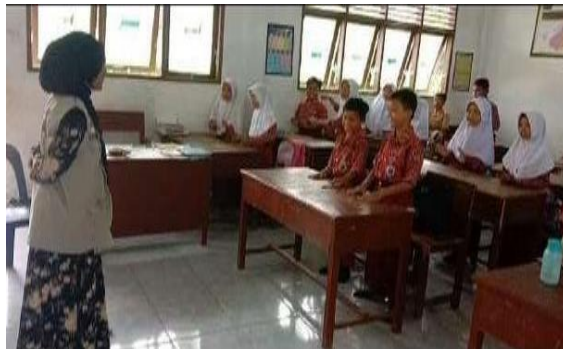
Figure 2. Activities for Providing Learning Materials on Ablution and Prayer Fiqh to Students

The results of this community service are also supported by relevant literature. According to research conducted by A. Rahman (2015) on the role of religious education in shaping children's religious awareness, religious education provided interactively and participatory can form a strong understanding of religion in children. These results are in line with the findings of community service in Desa Baru, where an interactive approach and direct practice succeeded in increasing children's understanding and discipline in worship. In addition, research by Huda (2018) on the role of religious leaders in social transformation also supports the findings that the involvement of local leaders has an important role in maintaining the sustainability of religious education programs.