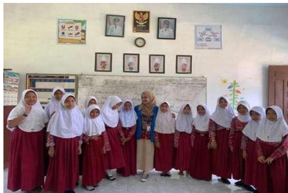
Figure 3. Group Photo with the Students